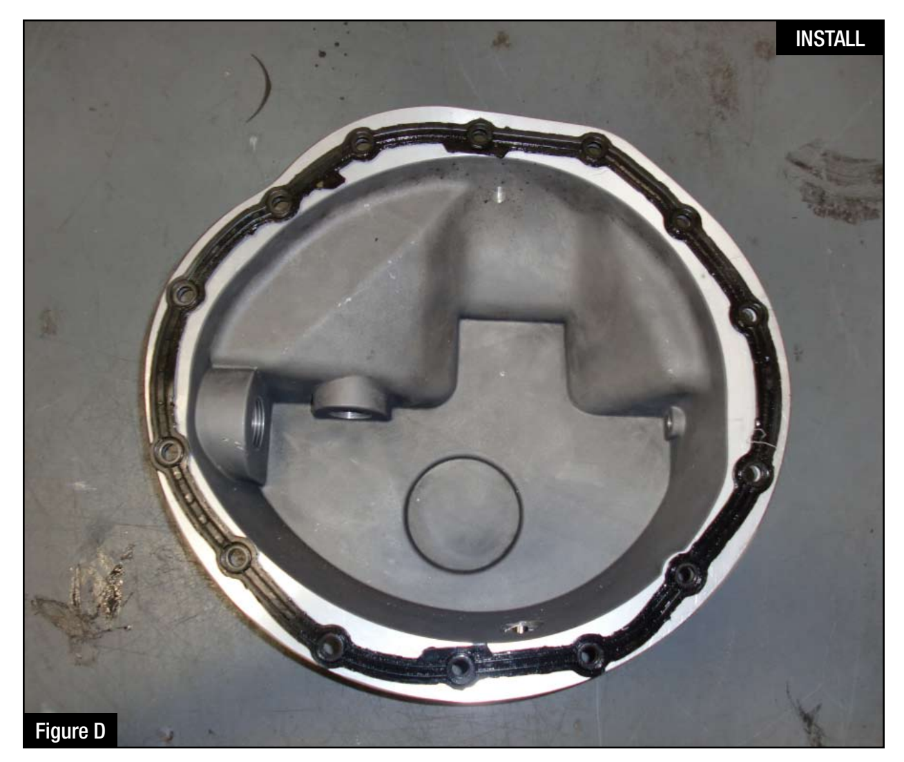
Refer to Figure D for step 11

Step 11: Lay your new gasket onto the aFe differential cover and align bolt holes.