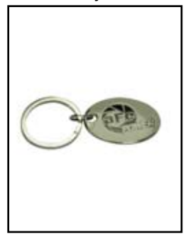
aFe Key Chain