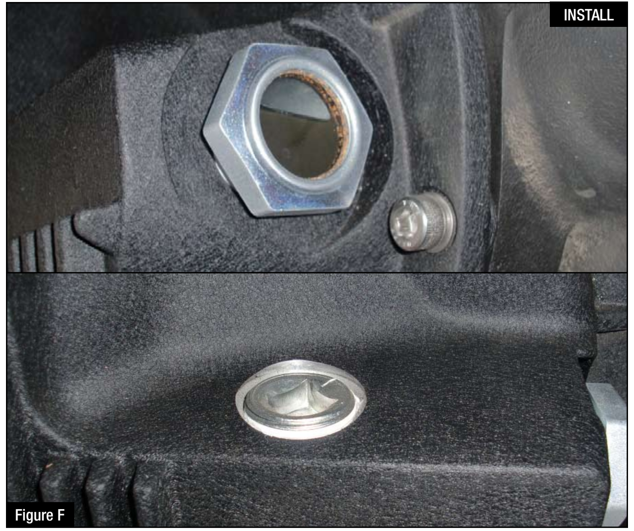
Refer to Figure F for step 15-18