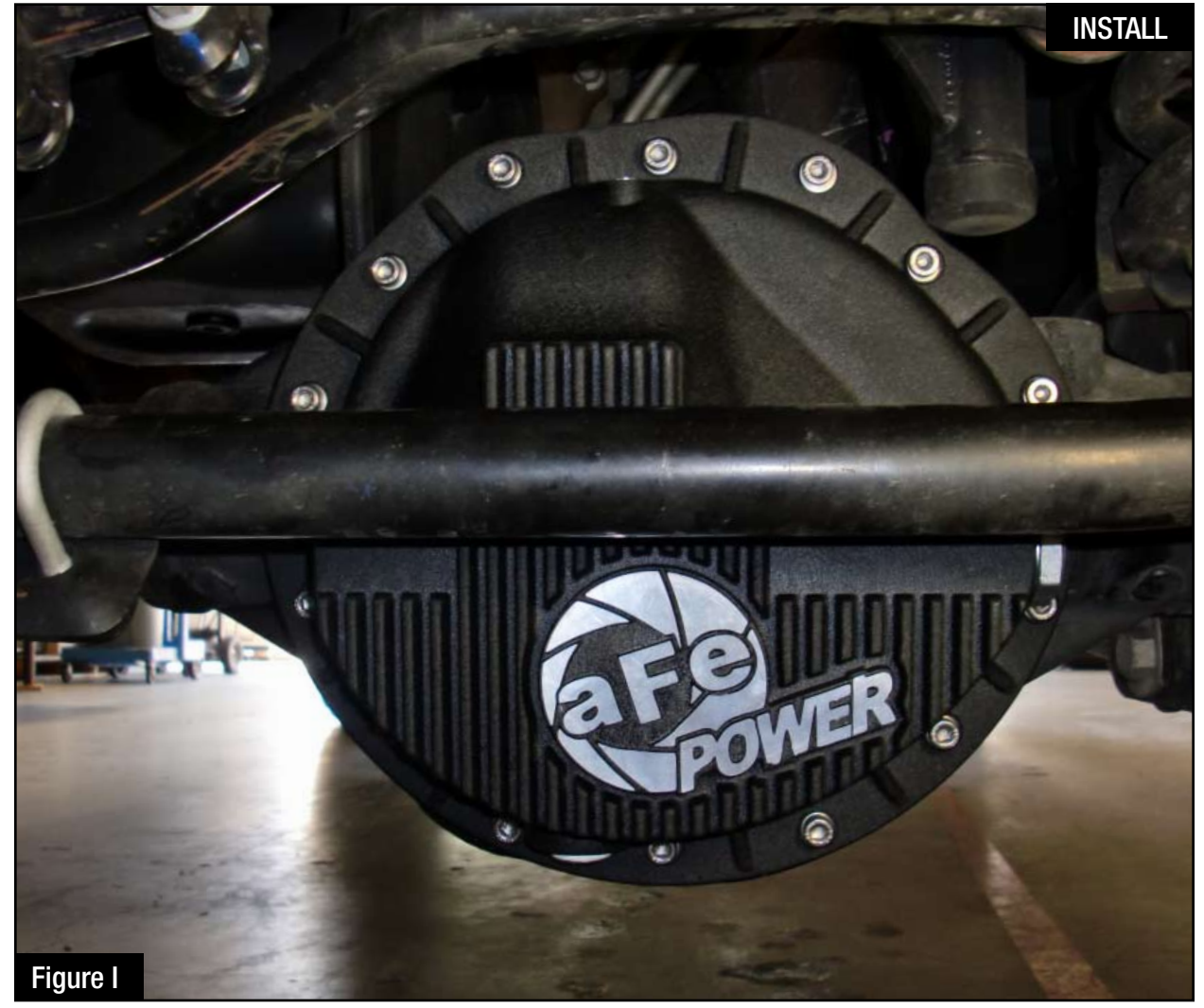
Refer to Figure I for steps 24