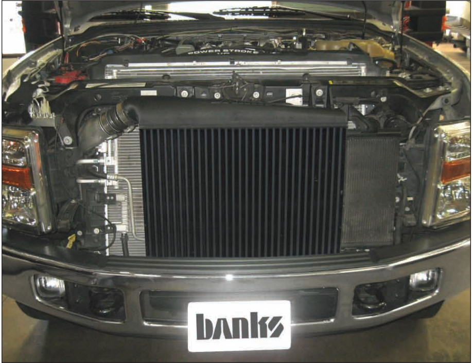
Figure 1 Banks Techni-Cooler

1. Disconnect the negative (ground) cable from the battery (or batteries, if there are two) before beginning work. Secure the cables so that they do not come in contact with the battery posts during installation.