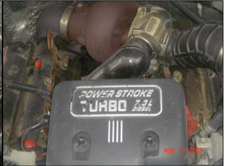
Hose not installed