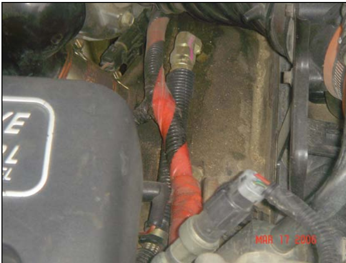
Left (Driver) side plug view