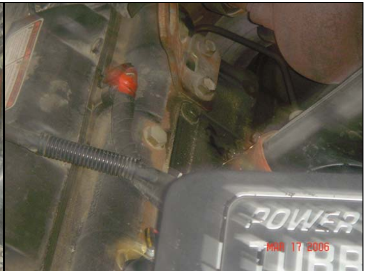
Right (Passenger) side plug view

Left side requires the relocation of the HPOP return line to the plug closer to the front