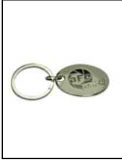
aFe Key Chain