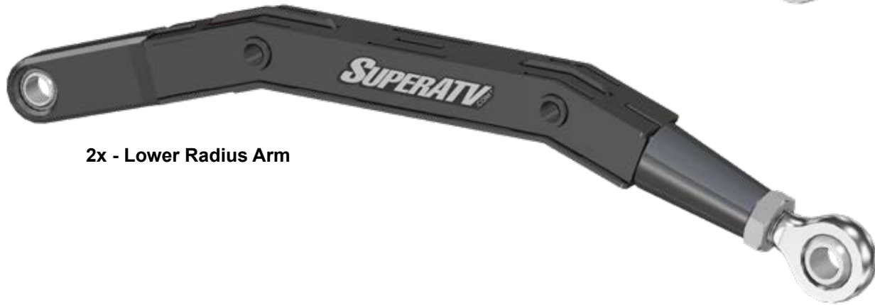
2x - Lower Radius Arm

SuperATV's® products are designed to best fit user's ATV/UTV under stock conditions. Adding, modifying, or fabricating any factory or aftermarket parts will void any warranty provided by SuperATV® and is not recommended. SuperATV's® products could interfere with other aftermarket accessories. If user has aftermarket products on machine, contact SuperATV® to verify that they will work together.