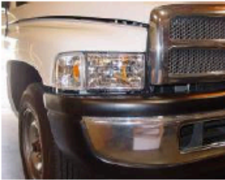
Step 12: Bolt on the headlight and check all functions before driving.