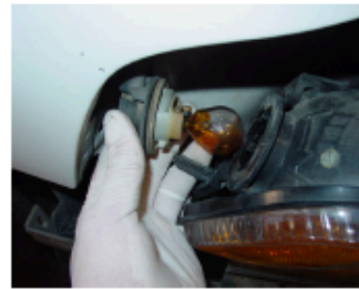
Step 11: Plug in the corner light.