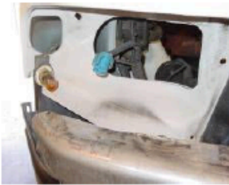
Step 9: Remove the headlight from the car.