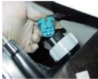
Step 10: Put in the new Anzo light and plug in the headlight harness.