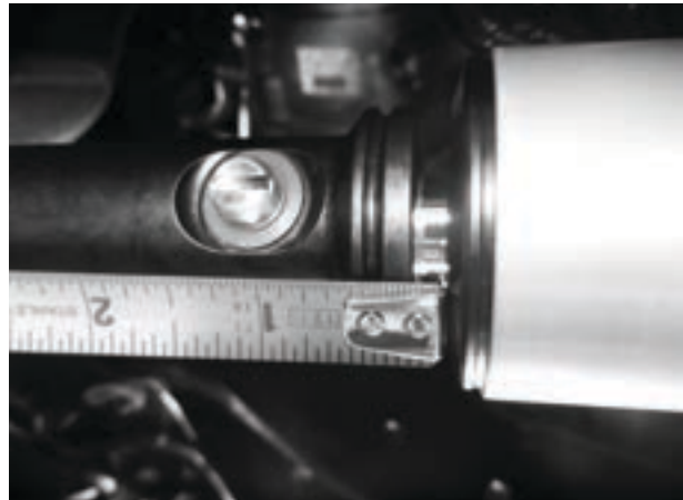
Fig. 1: Eyelet installed with 1/8" of shaft exposed.

5. Turn the vehicle's wheels completely to the right so they rest against the steering stops.