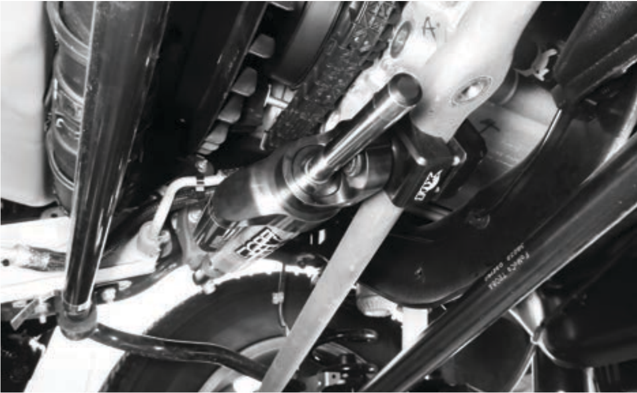
Fig. 2: Loosely clamp stabilizer to drag link.

6. Loosely mount Group A clamp to drag link with Group A fasteners (Fig. 2).