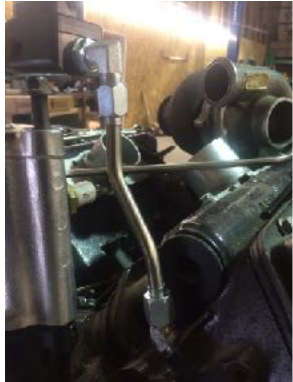
GEN3/Dual pump rear lines. Can be used on any model