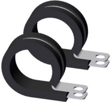
1/4" Windshield Clamps (2) pcs