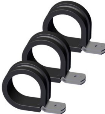
Snug Fit Clamps (3) pcs