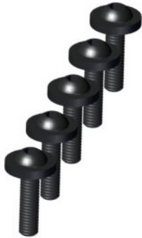
M6x25 Sealing Washers (5) pcs