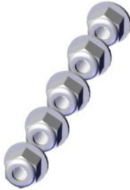
M5 Nylock Nuts (5) pcs