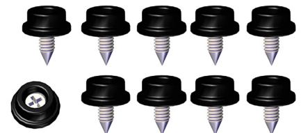
Self Drilling Snaps (10pcs)