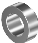
2x - Spacer Bushing