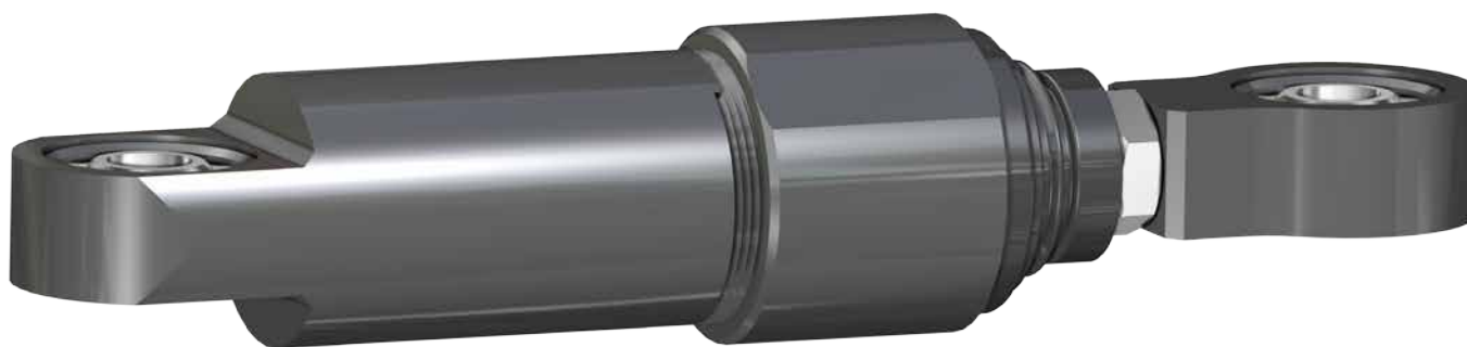
Sway Bar Link