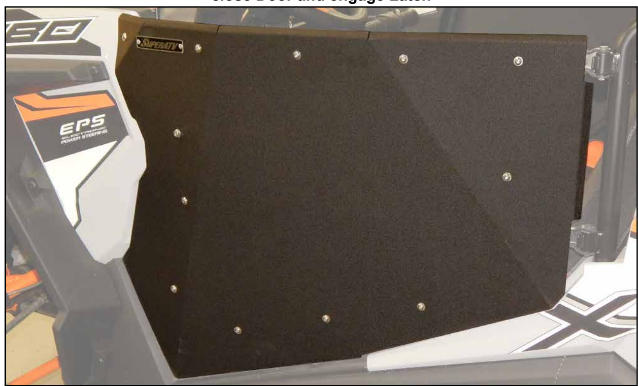
tighten hardware completely repeat steps for opposite Door