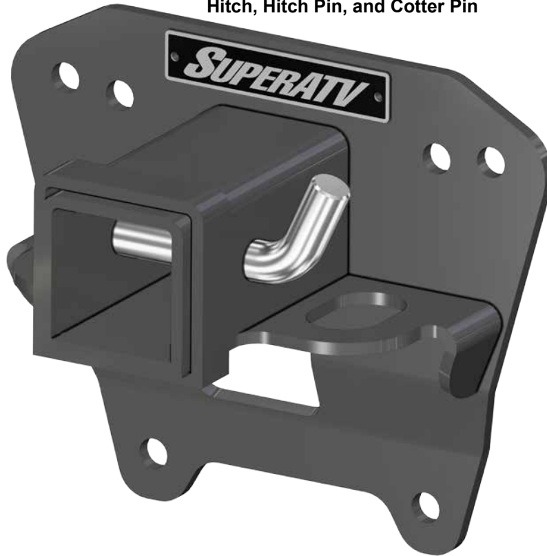
Hitch, Hitch Pin, and Cotter Pin