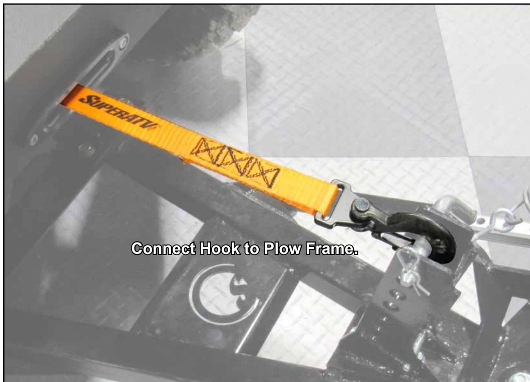
Connect Hook to Plow Frame.