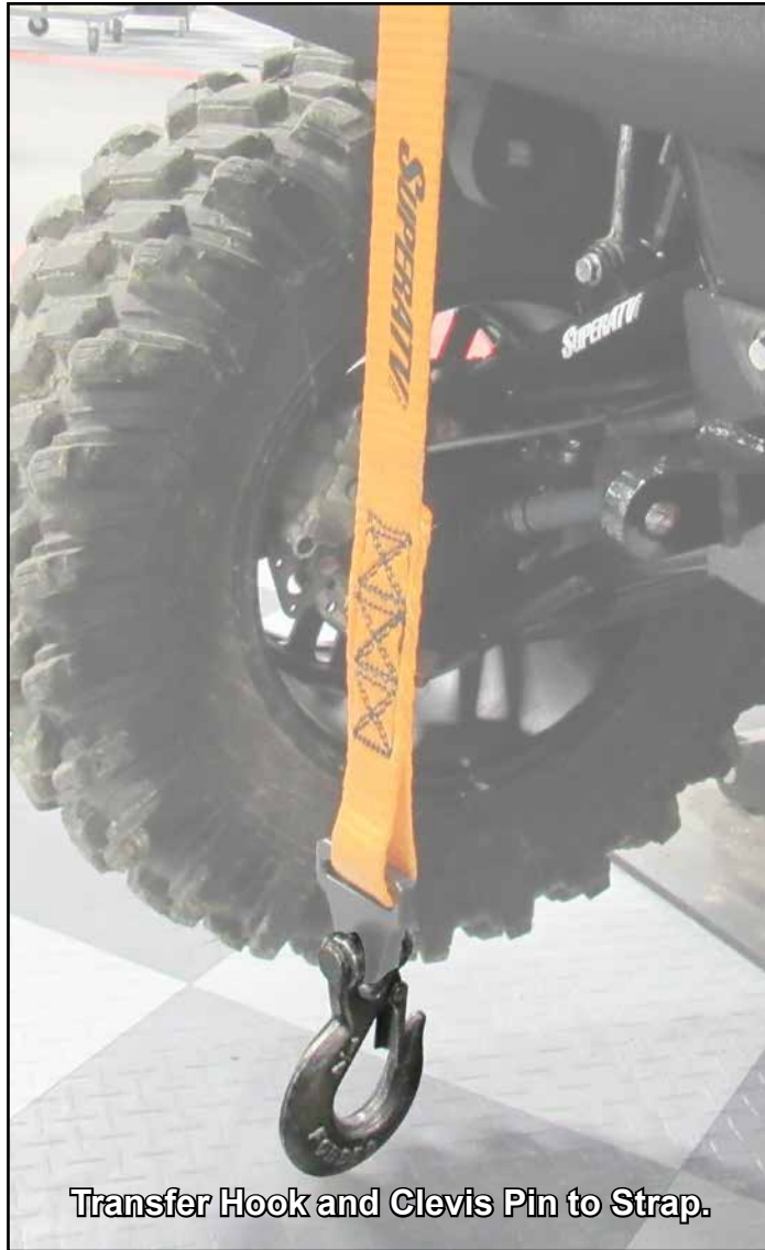
Transfer Hook and Clevis Pin to Strap.