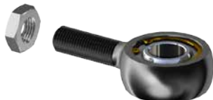
Tie Rod End x 2