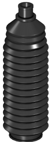
Boot x 2