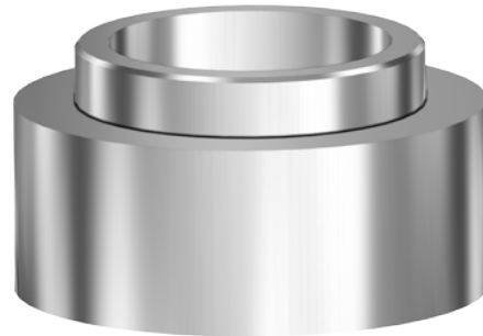
4x - Spacer

SuperATV strongly recommends using a Spring Compressor when removing and installing Springs.