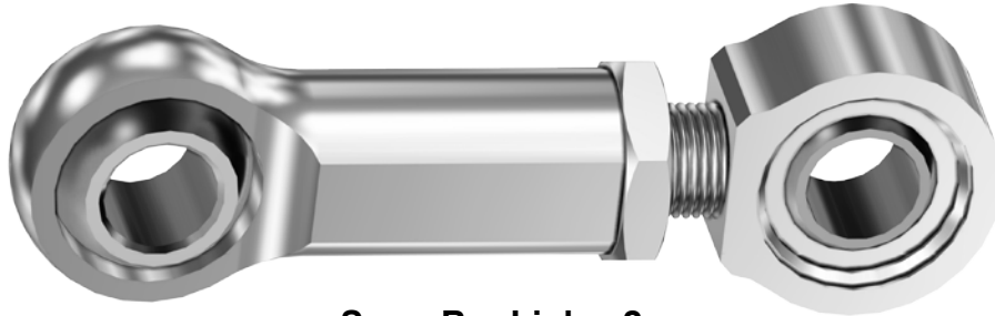
Sway Bar Link x 2

Kit includes M10 and M12 hardware. Compare stock hardware size with provided to determine which size should be installed.