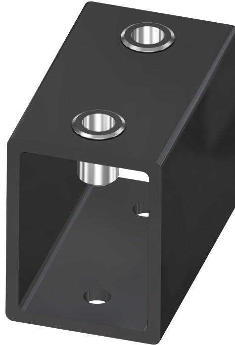
Riser x 4