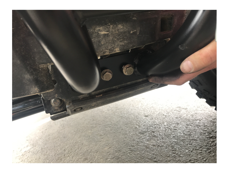
4.\,\mathrm{Tighten} the two upper M10 bolts making sure the bumper is level.

3. Now thread the two lower bolts in using the factory nut bracket.