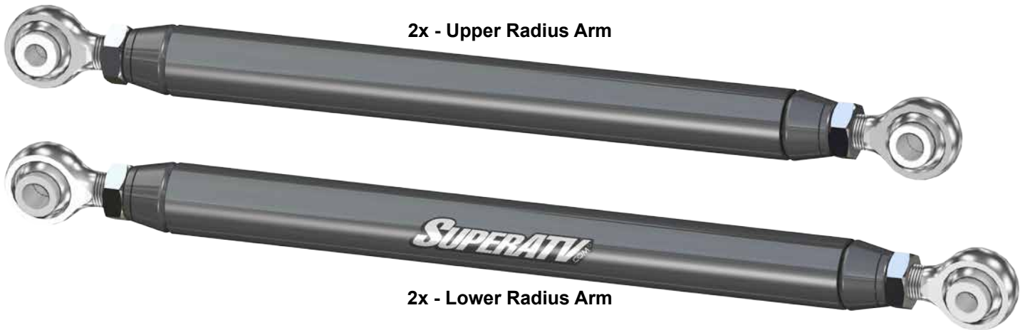
2x - Upper Radius Arm