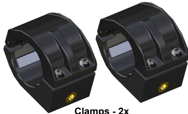
Clamps - 2x