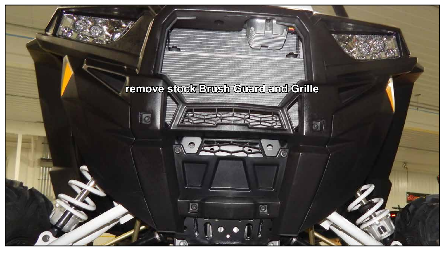
Trails and Rocks model only: