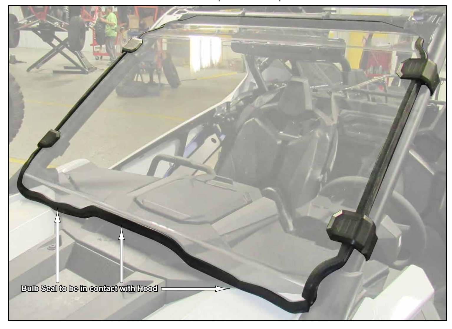
(reinstall Roof hardware if applicable)

- Place Windshield onto machine and secure with provided Clamps.