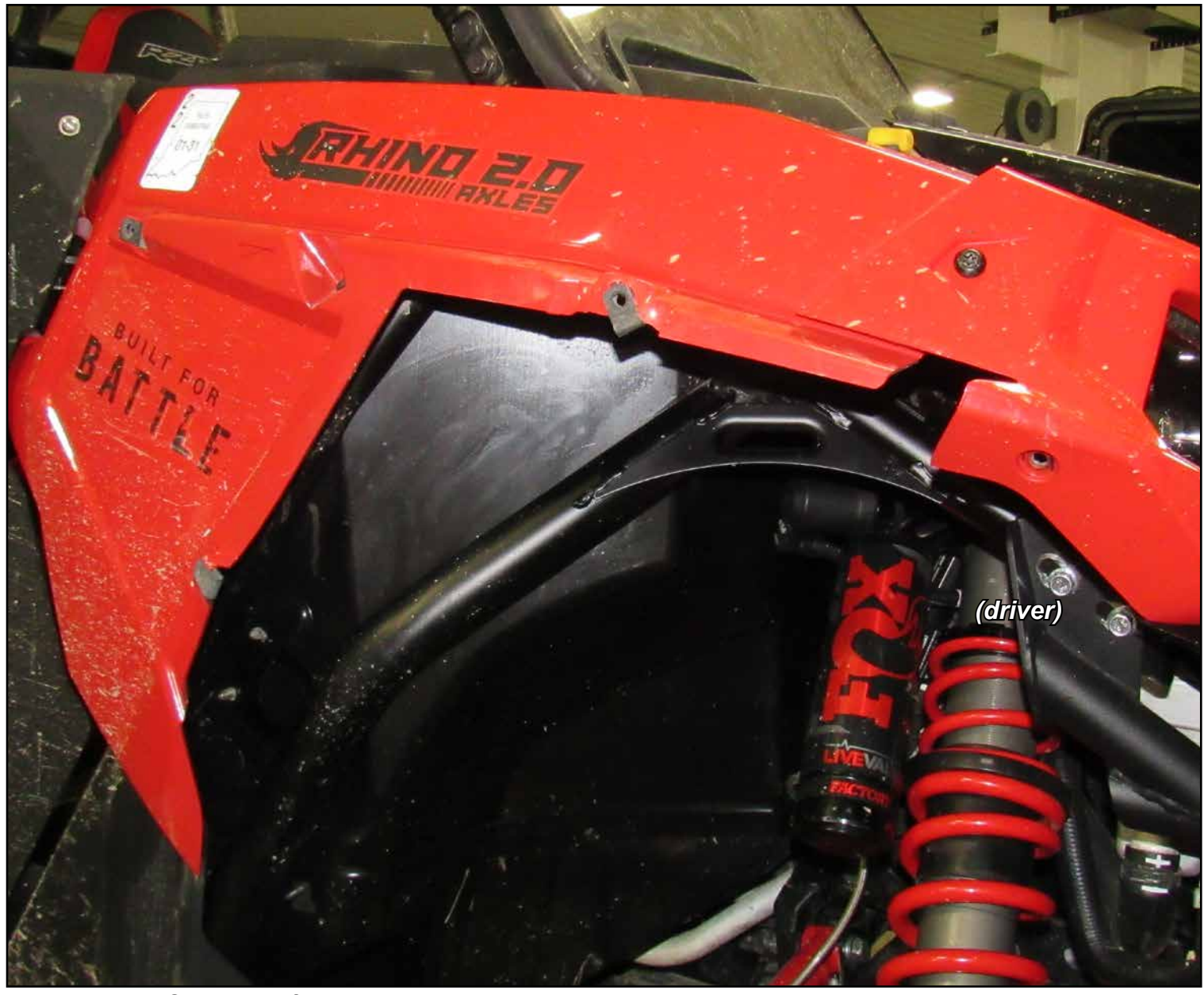
- Install stock Clip Nut to front location on Front Fender Flare.