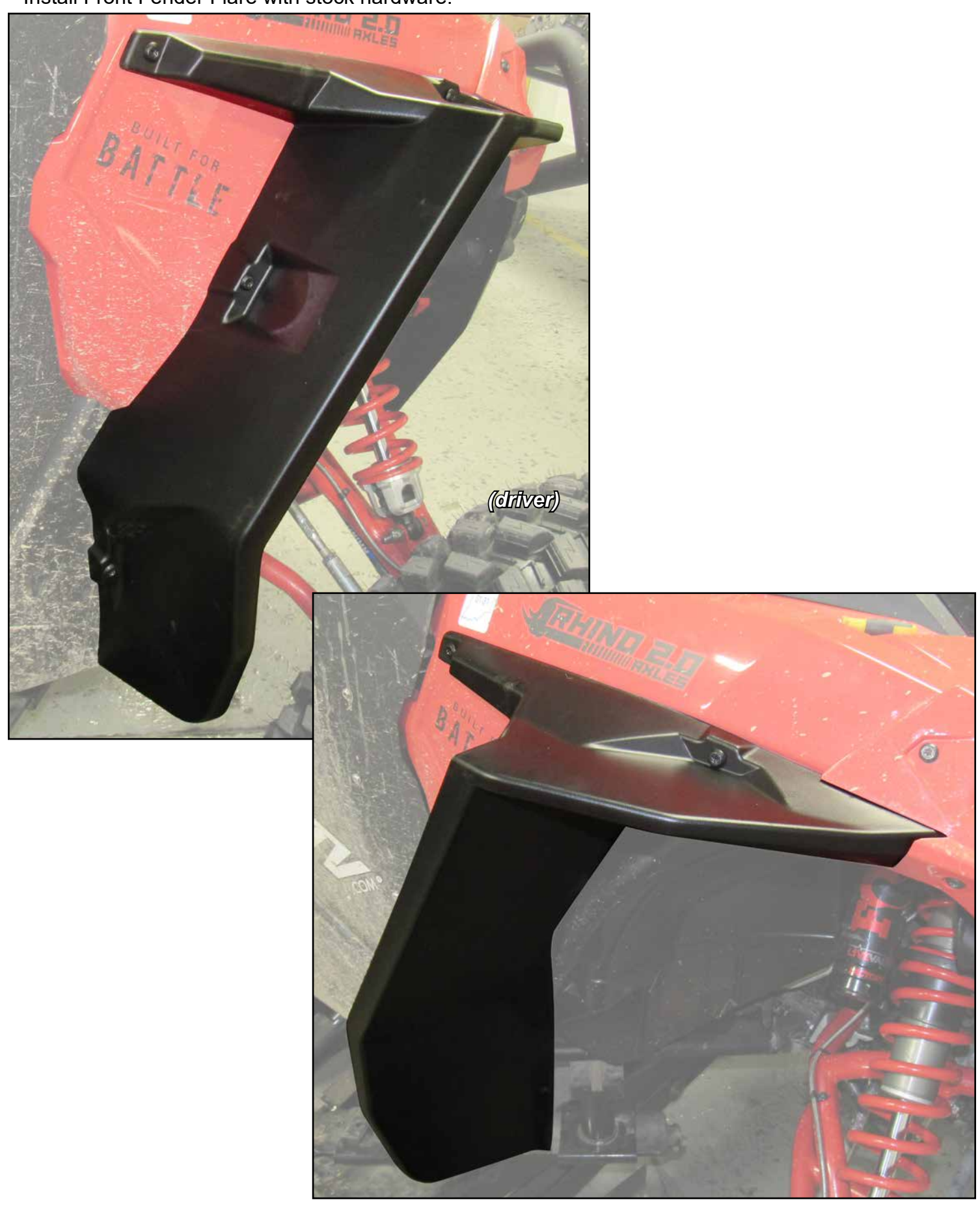
- Repeat steps for opposite side.

- Install Front Fender Flare with stock hardware.