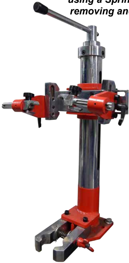
4x - Spacer

SuperATV strongly recommends using a Spring Compressor when removing and installing Springs.