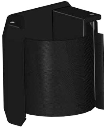
Mount Clamp Qty (4)