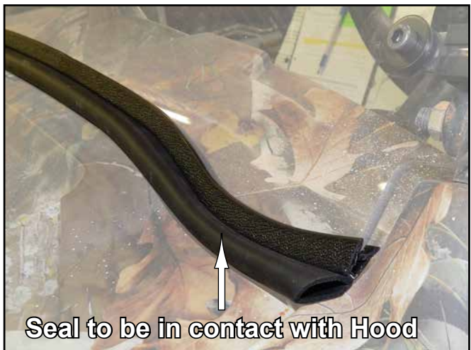
Seal to be in contact with Hood