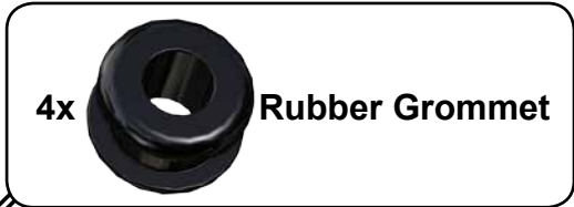
4x Rubber Grommet