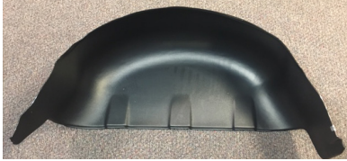
Wheel Well Guard Driver's Side (1)

Supplied Hardware 8 - #10 SEM Screws 8 - U-Clips