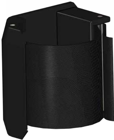
Mount Clamp Qty (2)