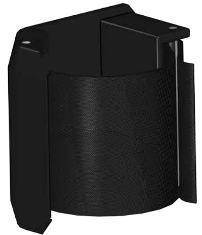
Mount Clamp Qty (2)