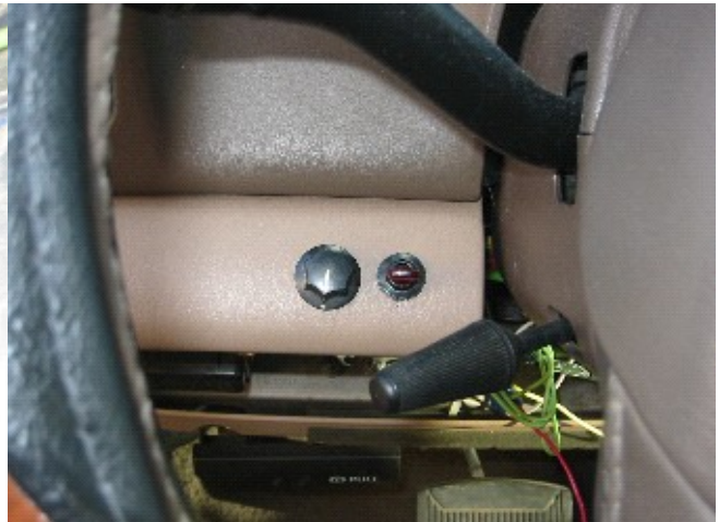
Dial (Figure 4)