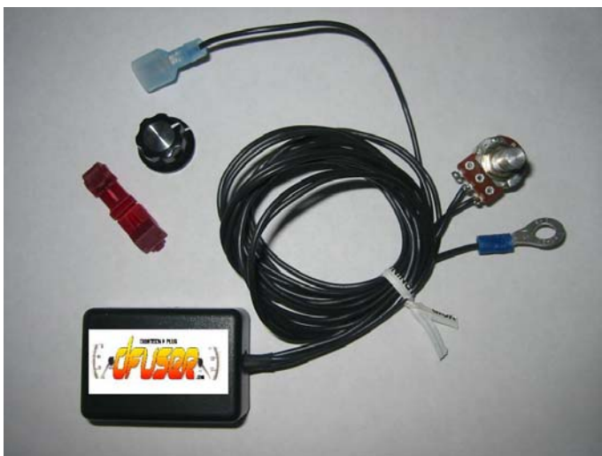
18K PLUS Power Module