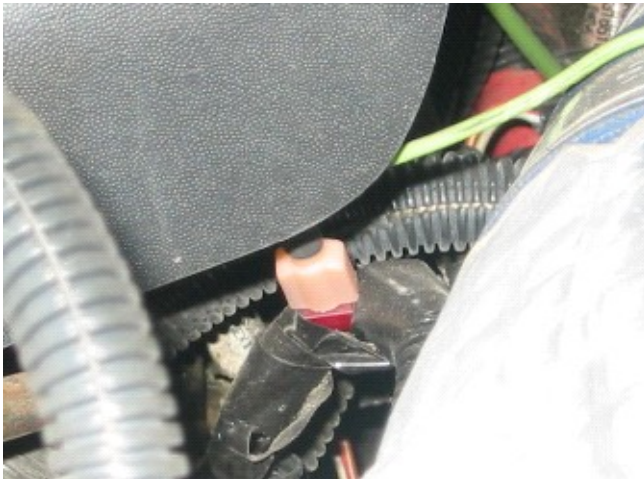
ICP Splice on BL/GR wire (Figure 3)