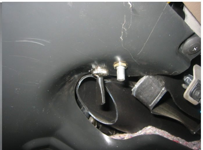
Mounting Location on bottom Panel for Excursion