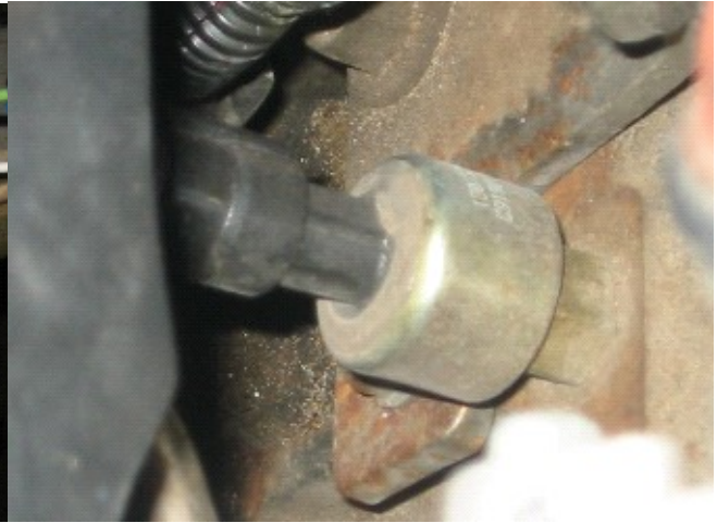
ICP (Figure 2)