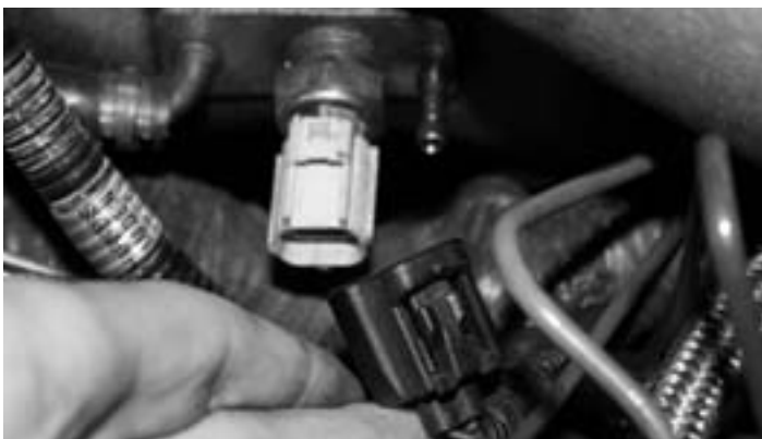
4- Disconnect the temp sensor.