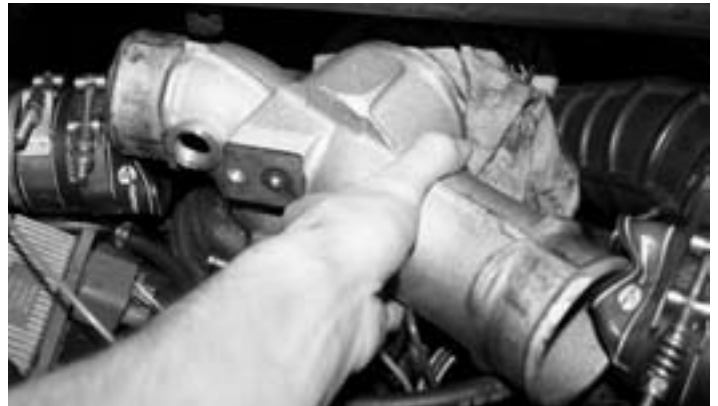
15- Pull the manifold out of the vehicle and be careful not to let anything fall into the plenum openings.