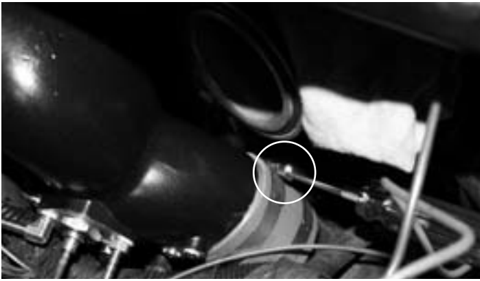
25- Now that you have the manifold in its desired location, tighten both sides of the lower manifold coupling clamps.