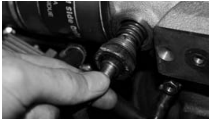
7- Once removed, put the heating element to the side for later install.