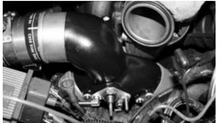
23- Once the manifold is in position, adjust the clamps to the desired location that makes them easiest to access.