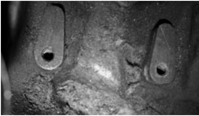
17- Use 3/8 - 16 tapped holes on the motor for the mounting support bracket.