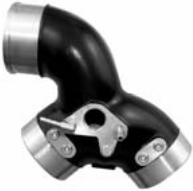
Turbo Outlet Manifold