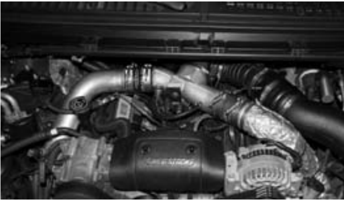
1- View of stock turbo outlet/ intake manifold. Disconnect the negative (-) battery terminals before installation.