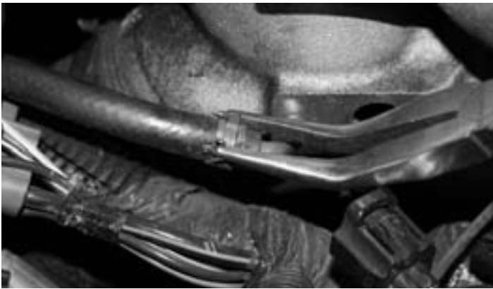
9- Using pliers to squeeze the clamp tabs, remove the rubber hose from the lower intake manifold fitting.