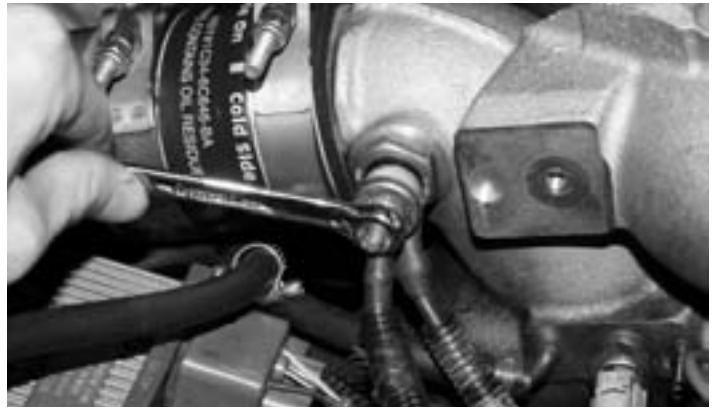
5- Using a 10mm wrench, remove the heating element wires.