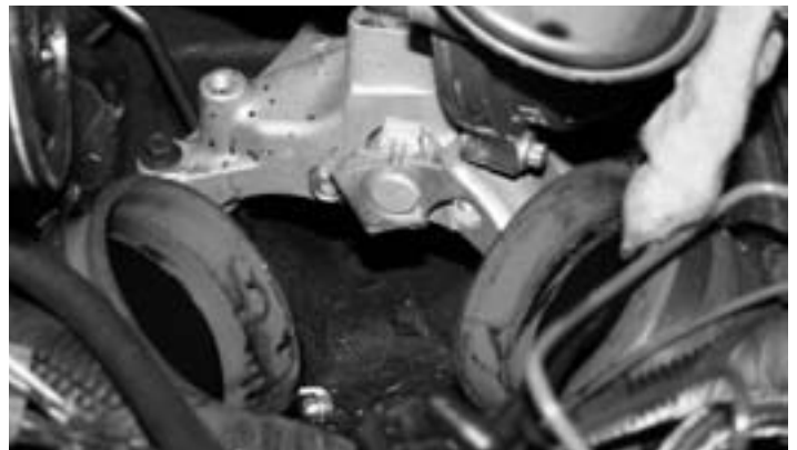
16- Locate the bracket mounting holes that are located directly under these two intake couplings. The holes are on the top of the motor as shown in Step 17.