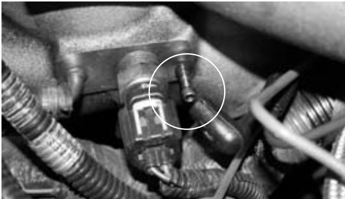
3- Disconnect the rubber boot/ hose.