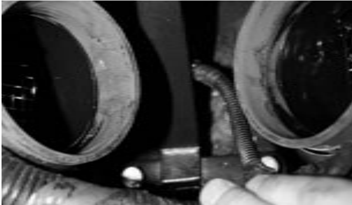
18- Install the manifold support bracket onto the top of the motor with 3/8 - 16 hex head cap screws supplied. Torque screws to 18 Ft. Lbs.