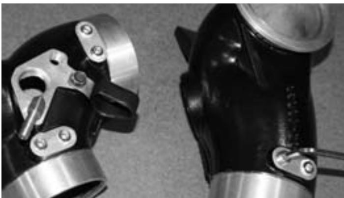
20- Install all 6 plugs and the 90 degree fitting elbow into the manifolds, then install the band clamp from the stock Y-inlet manifold.