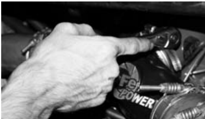
28- Position the turbo outlet manifold onto the turbo evenly and secure with the V-band clamp.