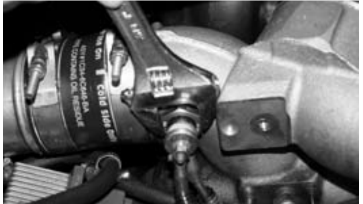
6- With an adjustable wrench, remove the heating element.