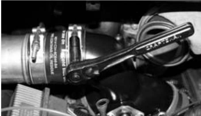
26- Slide the intercooler tube coupling onto the manifold, then tighten clamp. Torque to 9 Ft. Lbs.