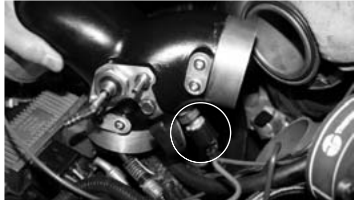
22- Connect the temp sensor before setting the manifold into the couplings.