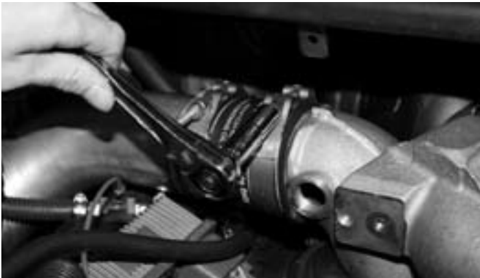
11- Loosen the clamp holding the manifold to the intercooler tube return side using a 7/16" deep socket.