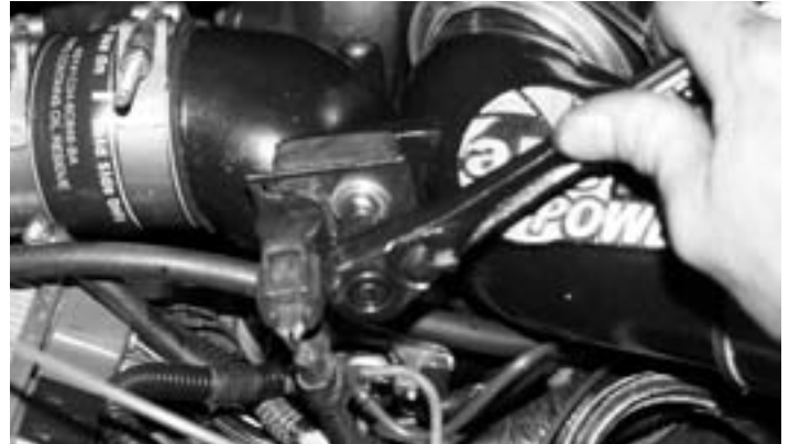
31- Now reinstall the boost control module. Reconnect battery.