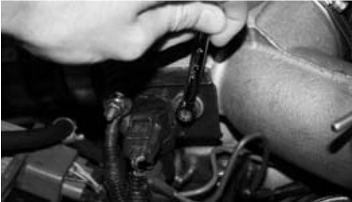
2- Remove the boost control module using a 8mm wrench or socket.