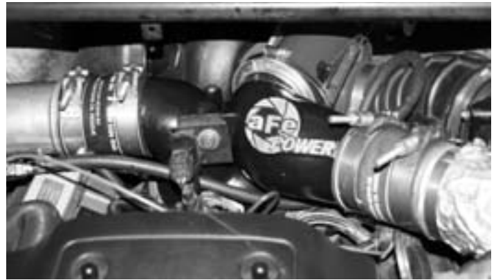
32- Your installation is now complete. Please check all components and retighten if necessary. Thank you for choosing aFe Power!