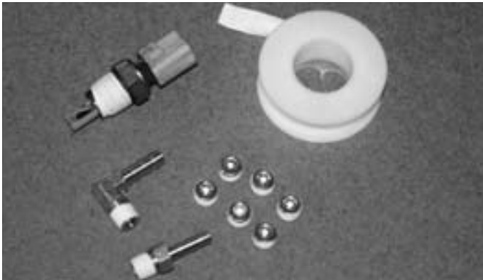
19- Using teflon pipe sealant tape, wrap a thin layer around the threads of each component.