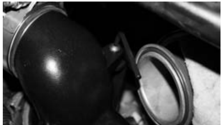
24- Line up the lower manifold with the support bracket and install the hex flange head screw supplied.