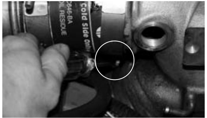
13- Loosen both upper clamps on the Y-inlets of the stock intake manifold as seen in this photo and also in step 14.