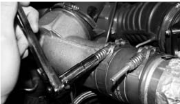
12- Loosen the clamp holding the turbo outlet coupling to the intercooler tube using a 7/16" deep socket.