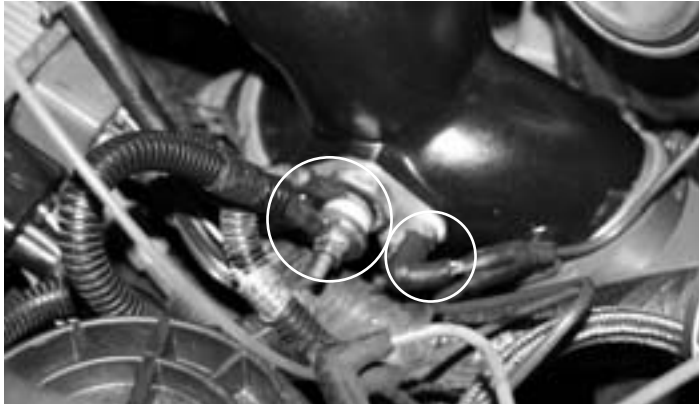
27- Now reinstall the lower manifold wires and hoses that you disconnected in steps #3, #5, and #9.