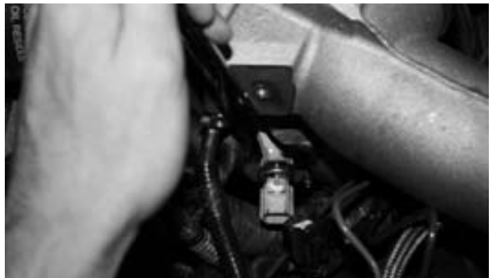
8- Remove the temp sensor from the lower manifold using a 13mm wrench and put aside for later install.