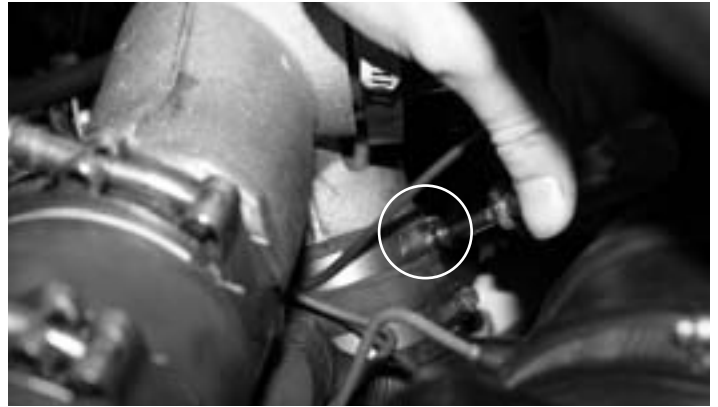
14- If needed, replace the couplings with Ford part number F81Z 6C640-FA available from your local dealer.