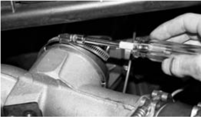
10- Using a flat head screw driver or 5/16" nut driver, remove the turbo manifold V-band clamp.