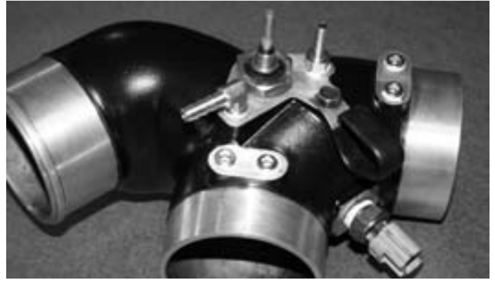
21- Install the heating element and temp sensor into the manifold and, last install the brass hose nipple. Torque all items to 16 Ft. Lbs.