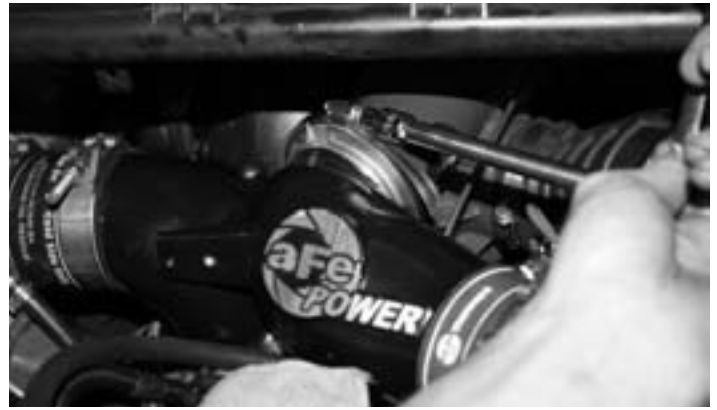
29- Once the manifold is in its desired position, firmly tighten down the turbo V-band clamp.