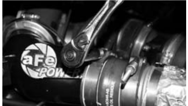
30- Install the hot side intercooler tube coupling onto the turbo manifold. Torque clamp to 9 Ft. Lbs.