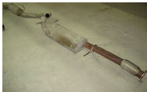
Figure 5 Removed stock system