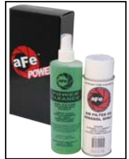
Gold Aerosol Restore Kit