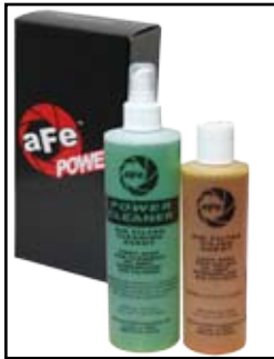
Gold Squeeze Restore Kit