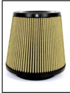
Pro GUARD 7 Air Filter