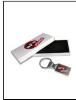
aFe Key Chain