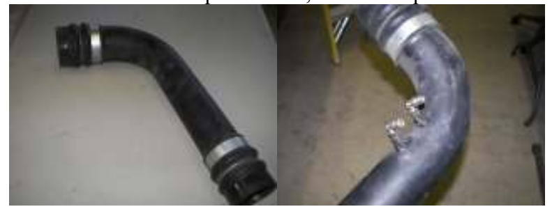
Step 3. Slide tube out from top and mark, drill and tap for nozzles.

Tip : Mount nozzles approx 3" apart so spray is 90° to airflow. Tip : To make sure there is no pooling of fluid while injecting, make sure nozzle tip is at least flush with the inside of the tube when tightened.