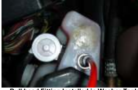
Bulkhead Fitting Installe<mark>d in</mark> Washer Tank.