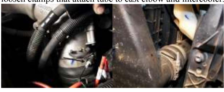
Step 2. Pry rubber boots off intercooler and cast piece.