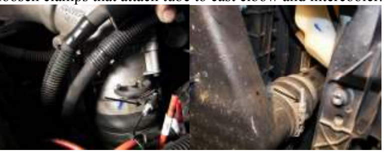
Step 2. Pry rubber boots off intercooler and cast piece.

loosen clamps that attach tube to cast elbow and intercooler.