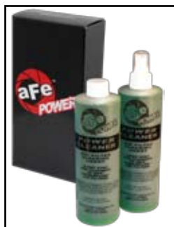
Pro DRY S Restore Kit

P/N: 28-10031 Yellow P/N: 28-10032 Red P/N: 28-10033 Black P/N: 28-10034 Blue