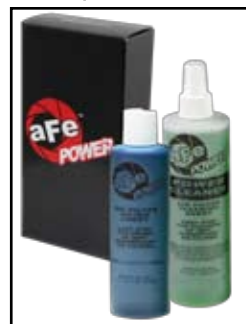
Blue Squeeze Restore Kit