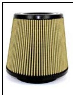
Pro GUARD 7 Air Filter