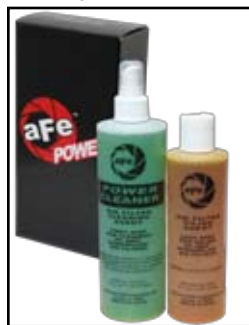
Gold Squeeze Restore Kit