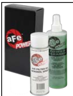
Blue Aerosol Restore Kit