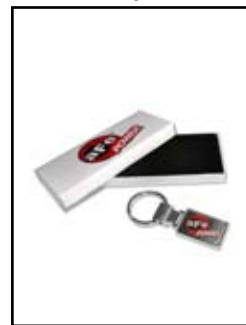
aFe Key Chain