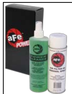
Gold Aerosol Restore Kit