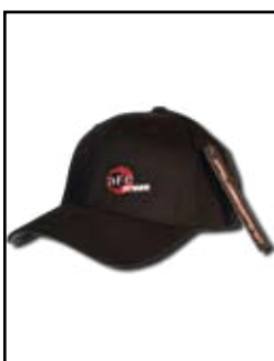
aFe Power Hat