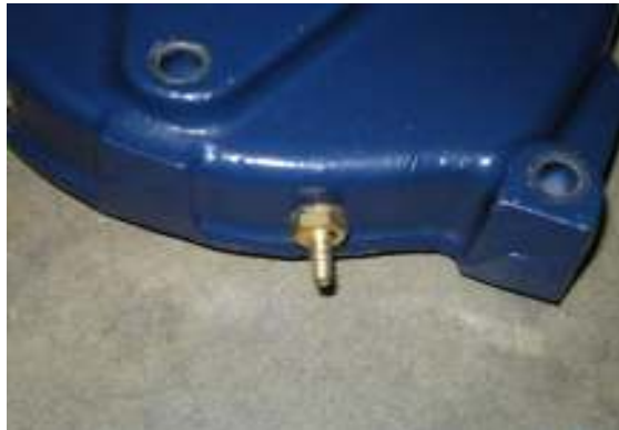
Optional Hose Barb

The nozzle is mounted into the intake using its external 1/8 NPT threads. Tighten the nozzle and nozzle holder assembly one half turn past hand tight using E6000® sealant to seal the threads.