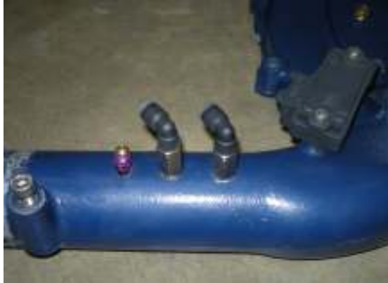
Nozzles Mounted In Upper Intake

Remove the upper intake manifold in order to drill and tap (11/32" pre-drill, 1/8"-27 NPT tap) for one or two nozzles.